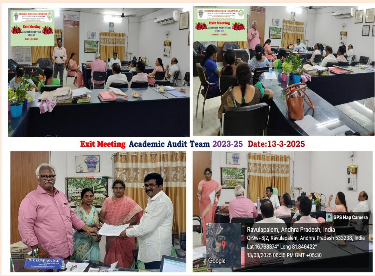
Exit Meeting Academic Audit Team 2023-25 Date:13-3-2025