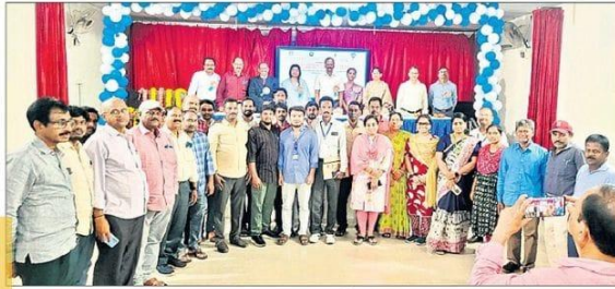
వర్క్ షాప్ ముగింపు కార్యక్రమంలో పాల్గొన్న ప్రముఖ డిగ్రీ కళాశాలల లైబ్రరీయన్లు