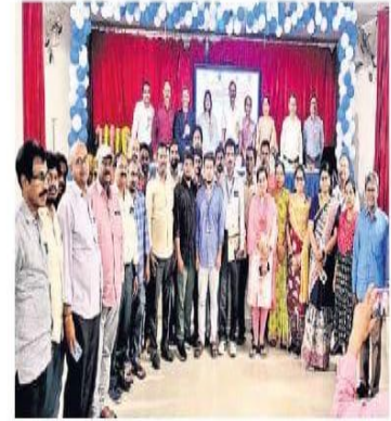
వర్క్ షాప్ లో పాల్గొన్న ప్రభుత్వ కళాశాలల గ్రంథాలయ అధికారులు