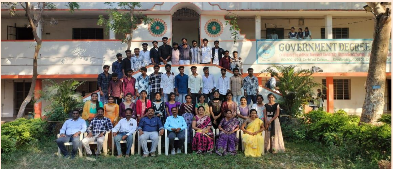
Final Year B.Com (CA&General) Farewell Party