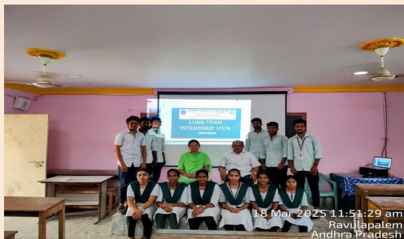
Final year Semester internship students